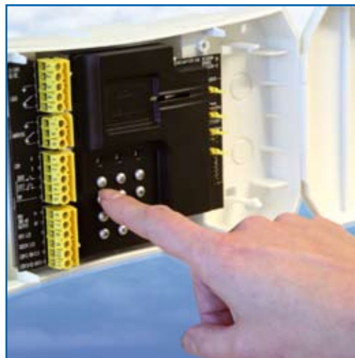
Entro Lite as a stand-alone system can be programmed from the door controller DC800.

The programming can either be carried out from a connected PC using the Entro Lite software, or via the internal keypad with no need for shadow cards, making system set up simple and quick. Entro Lite is installed in a split configuration with the DC800 Door Controller mounted in an internal protected environment whilst the actual Reader is mounted separately, thus producing a more secure system. It is also possible to connect two Readers for both entry and exit (BCLINK Only).