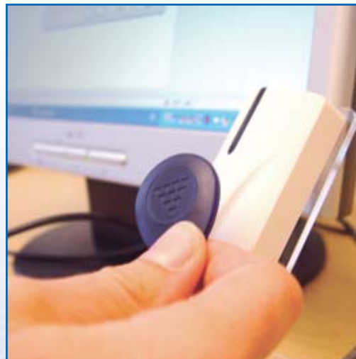
USB-RIF/2 with reader (PR500) is a useful tool when logging in to the software, doing a quick search and for enrolment reading.

Bewator Entro Lite installed and supported by: Axxess 28 Ltd Tel 0845 680 0228 Fax 0845 680 0229 Email: sales@axxess28.com www.axxess28.com