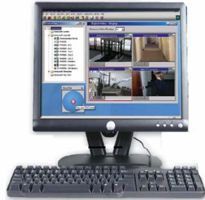
Access Control Management software