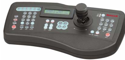
System Control Keyboards