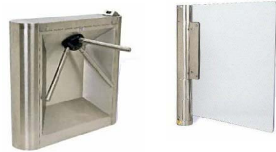
Half Height Internal Turnstiles and Glass Gates