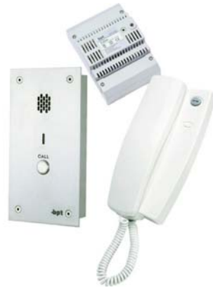
Vandal Proof Audio Entry Systems