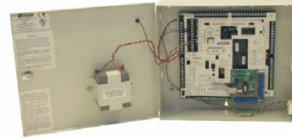
Intelligent Door Controllers