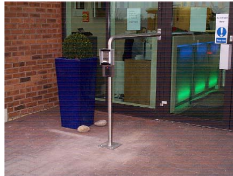
Bespoke balustrades for disabled access entrances