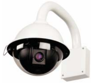
Fully Functional Dome Cameras