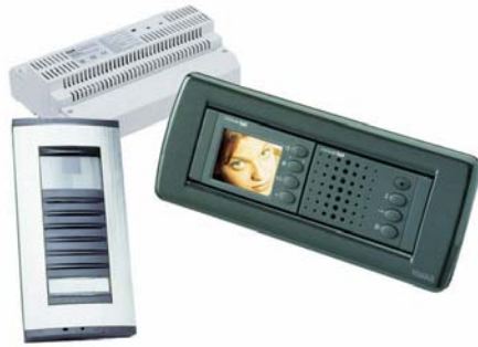
Audio and Colour Video Entry Systems