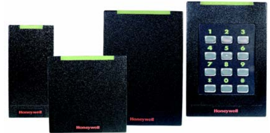
Contactless Smart Card Readers