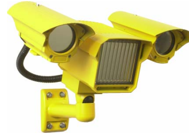
Numberplate Reader Cameras