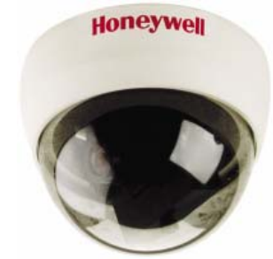
Internal Mini-Dome Cameras