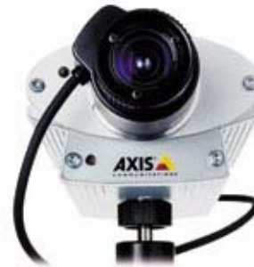
IP Network Cameras