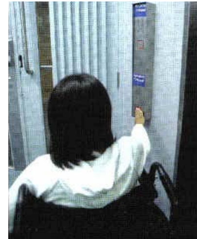
DDA Entry Phones for disabled access entrances