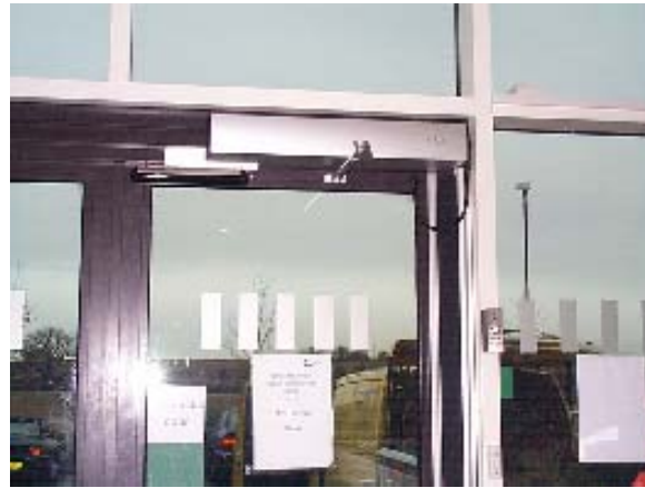
Electro-Hydraulic Automatic Door Openers