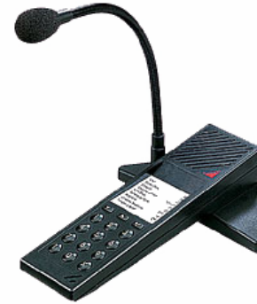
Networked and VoIP Intercom Systems