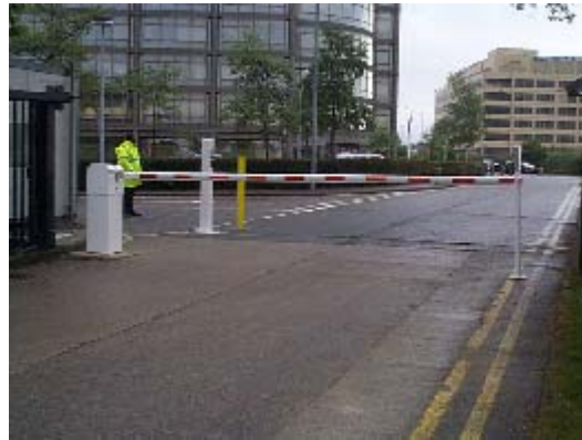
Automatic Traffic Barriers