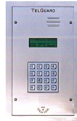
PSTN / PABX Telephone based entry phones