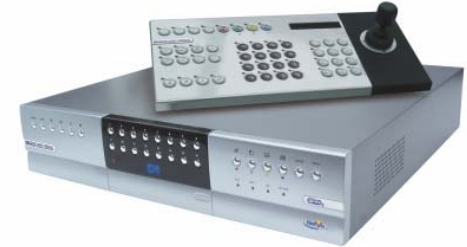
Networked Digital Video Harddisk Recorders