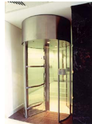
Rotating Security Doors