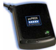
PC Logon (Logical Access)